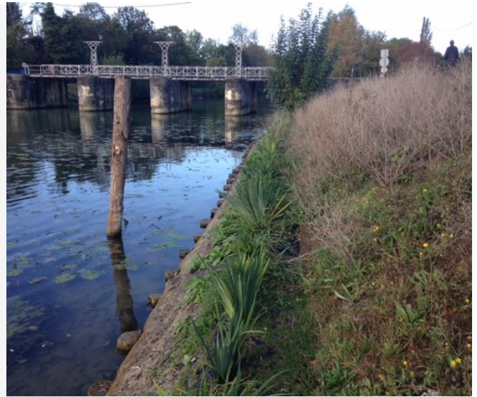
View of plantations of helophytes plants a few weeks after installation