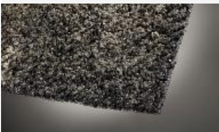
EnkaMat® A20 Prefilled erosion control mat

China +86 519 6858 5555 Hungary +36 23 610 870 France +33 1 74 90 00 13 Netherlands +31 85 744 1300 Germany +49 6022 812020 USA +1 800 365 7391