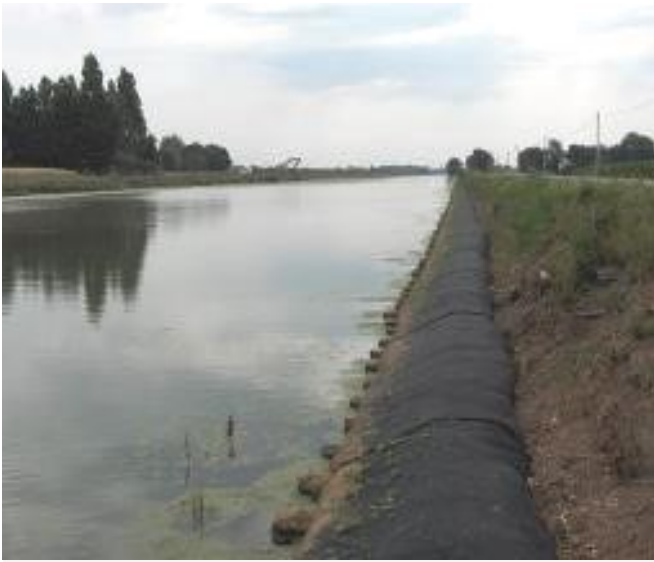
View of a the berm embankment footing formed by EnkaMat A20 before planting